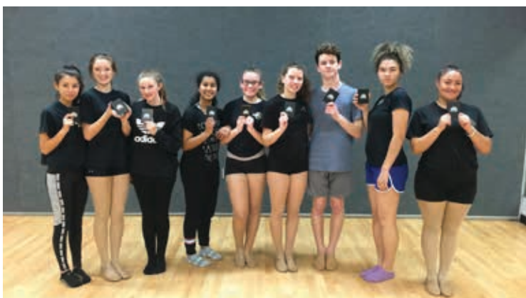
Tuesday 8:15 Class