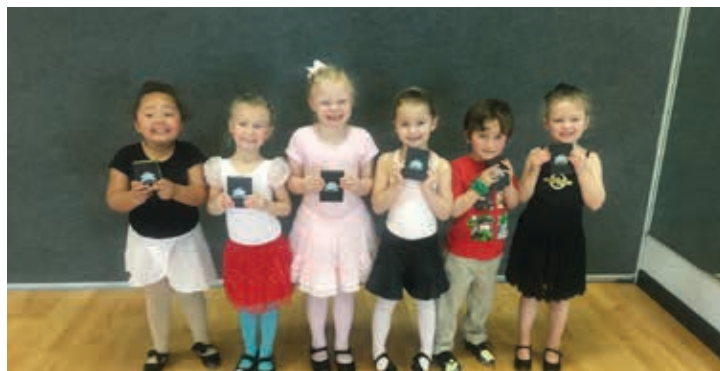
Saturday 10:30 Class