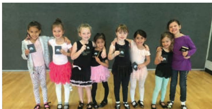
Saturday 11:30 Class