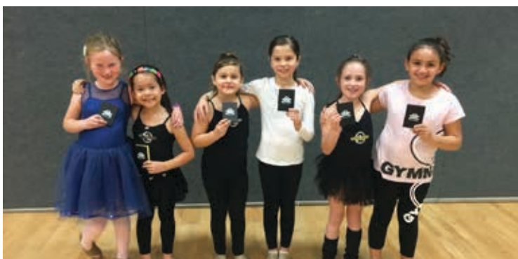
Wednesday 5:30 Class