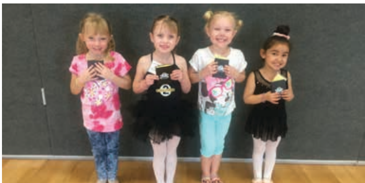
Saturday 9:30 Class