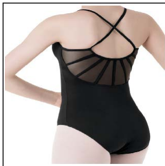
#MT9158 Illusion Mesh Fan/Camisole Leotard: Adult: S, M, L, XL