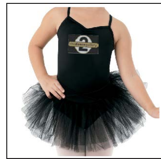
#D9354 Leotard w/Tutu Child: XS, S, M, L