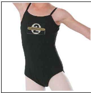
#CL120C/CL1270 Camisole Leotard Child: XS, S, M, L Adult: S, M, L, XL