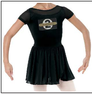
#D9352 Mesh sleeve leotard w/ attached chiffon skirt Child: XS, S, M, L