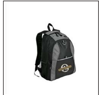
Two-Tone Backpack BG 1020