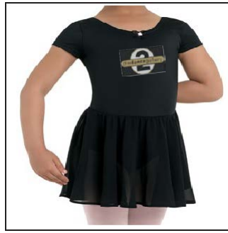
#D9392 Short Sleeve w/attached chiffon skirt. Child: XS, S, M, L