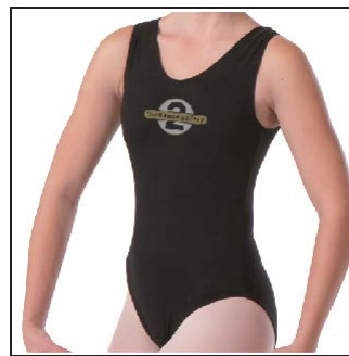
#CL1750C/CL1750 Tank Style Leotard Child: XS, S, M, L Adult: S, M, L, XL