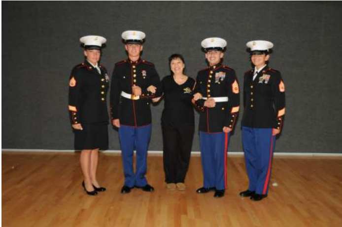
The DG2 Family Proudly Supports The U.S. Marines

Bring a new, unwrapped toy to donate to the "Toys for Tots" project and get one complimentary Holiday Revue ticket. *Limit one per family. The U.S. Marines will be on hand during our performances to support the DG2 as we support them. They always enjoy being part of our Holiday Revue, and we love having them! DG2 will be accepting the toy donations for the Marines during Family Fun Fest and through December 2.