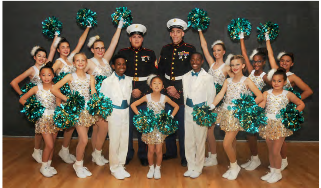
The 2019 DG2 Parade Dancers Pose With The U.S. Marines

What a great time of the year as we prepare for our annual Holiday Revue performance. All of our teachers are so proud of their dancers and can hardly wait to show them off onstage. Show night, dancers should arrive at Center High School Theater, 3111 Center Court Lane, in Antelope, ready to go onstage wearing their Dance Gallery 2 pink leotard or burgundy T-shirt. All dancers should arrive at least ½ hour before scheduled show time. The Holiday Revue show times are 6:00 and 7:30, and proceeds from ticket sales will benefit the Sutter Children's Center Child Life Program. The Child Life Program is known for its compassion and understanding of seriously and terminally ill children and their families. The Dance Gallery 2 has shared this relationship with Child Life for 28 years and our dancers are very proud of this event's "spirit of giving" during the holiday season!