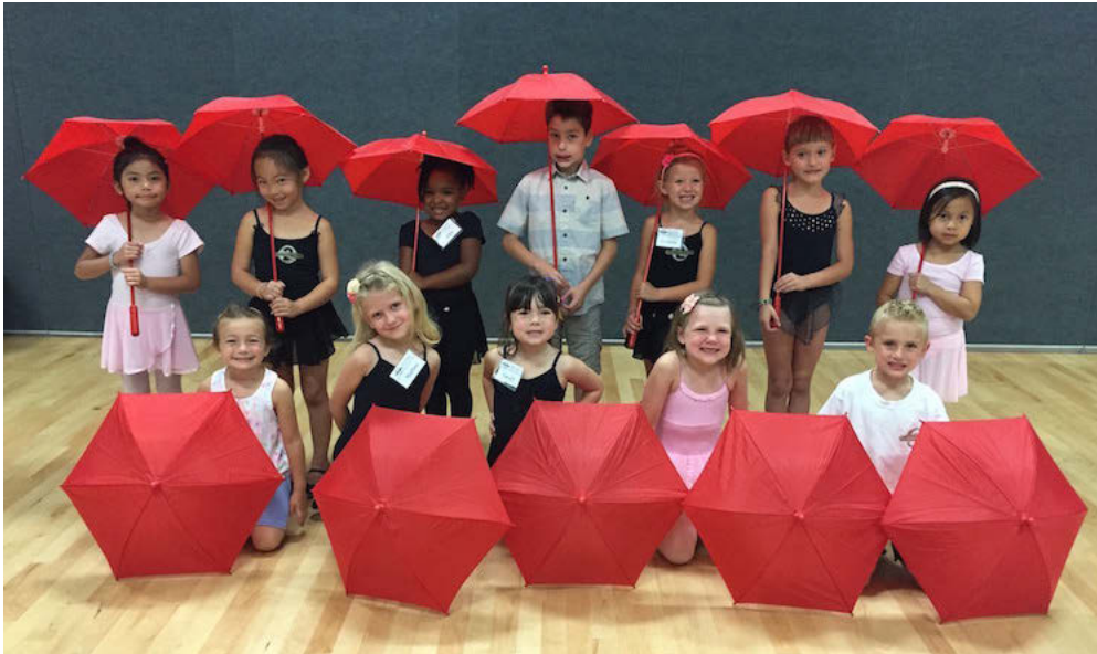
Our Saturday 11:30 class was "Tap Happy" dancing with their red umbrellas. It's fun to dance with a prop and it's fun to dance at the DG2!

Much of this is due to our fantastic group of Student Teachers and Jr. Student Teachers who were well prepared for all of the new classes. The classes look GREAT!