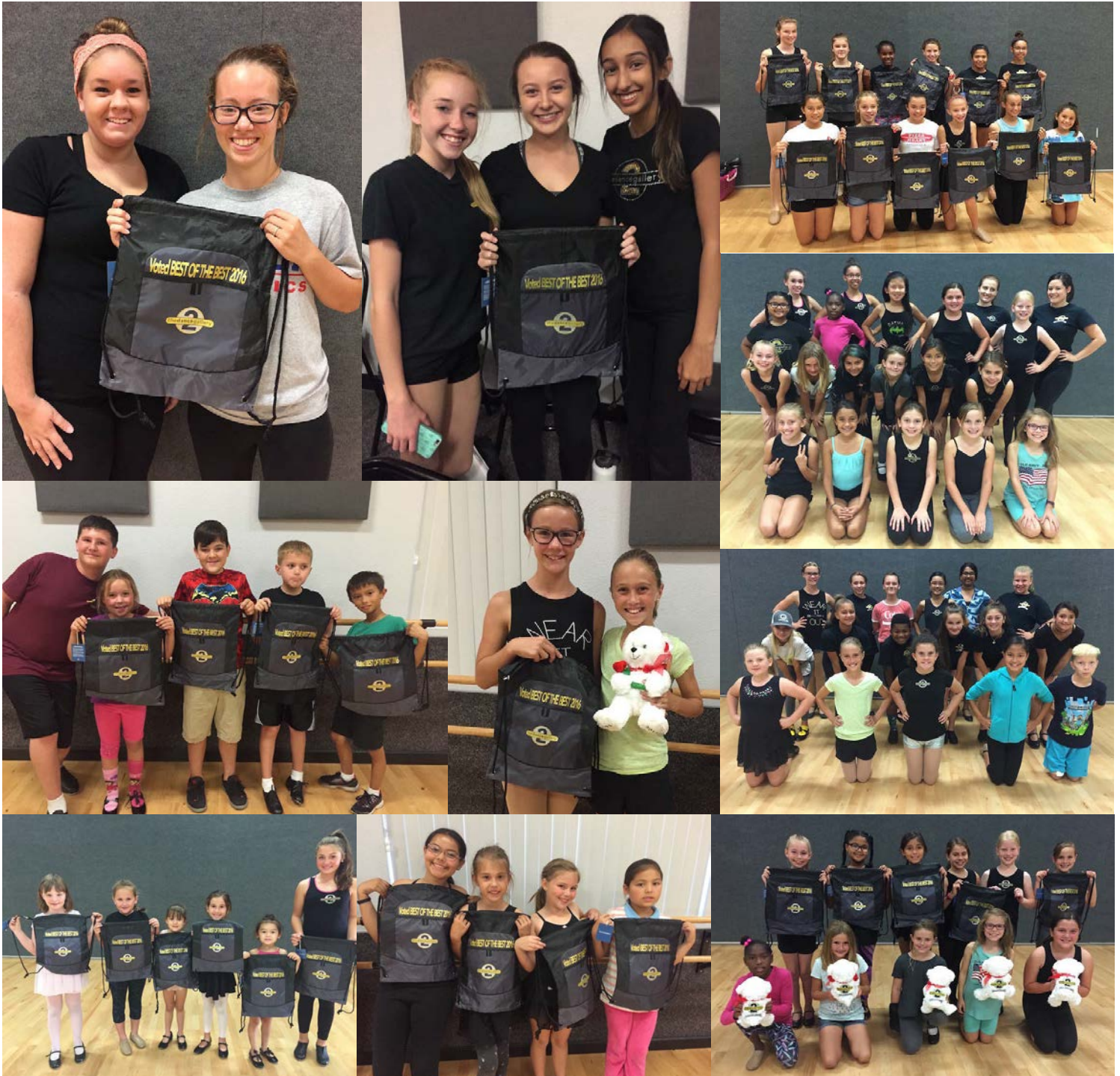
To see more pictures, check out the DG2 website. ( www.dancegallery2.com ).

The DG2 is excited about our very successful "Bring a Friend" Week and for all those who experienced the magic of DG2! Everyone, from the dancers to the teachers, had so much FUN!! Have you ever wanted to show your friends why you are always so happy on dance day? NOW THEY KNOW! If your friend decides to dance with us at the DG2, you can take advantage of our referral program and get a discount on next month's tuition. Remind your friend to list your name on their registration form when they sign up to join our DG2 family! Offer expires October 15.